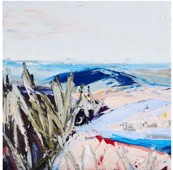
Towards the Barringtons