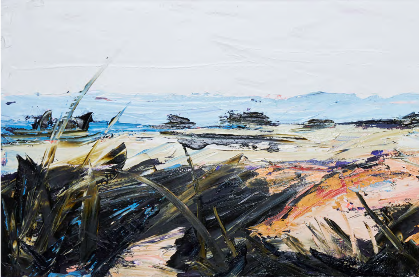
Waving Grasses, Yellow Billy Ridge 2021, oil on canvas, 50 x 152cm