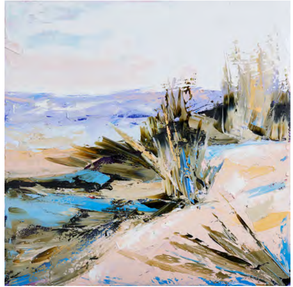
Of Scentless Flowers and Songless Bird 2021, oil on canvas, 120 x 120cm