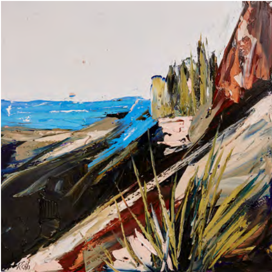
The Magpie Warbles Clear and Strong 2021, oil on canvas, 75 x 75cm