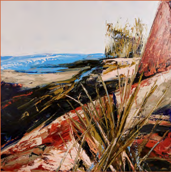
The Long Day Through