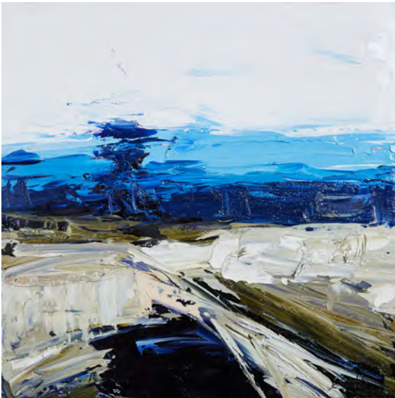
Forces of Nature