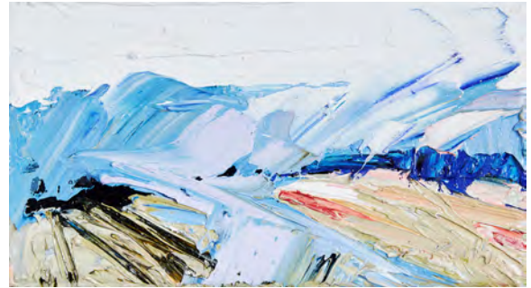
Opposite page: