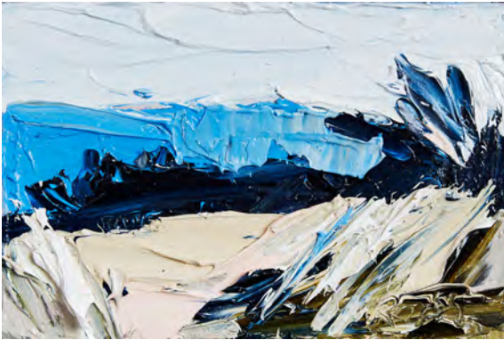
The Broken Back i 2021, oil on wood, 10 x 15cm