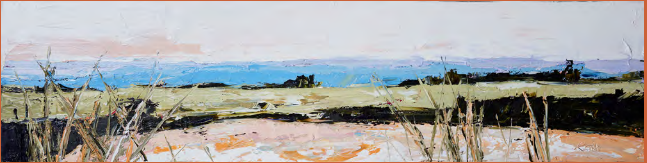
Journey to the Top, Broken Back Range