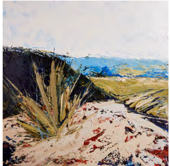
Let Nature Take Over 2021, oil on canvas, 120 x 120cm