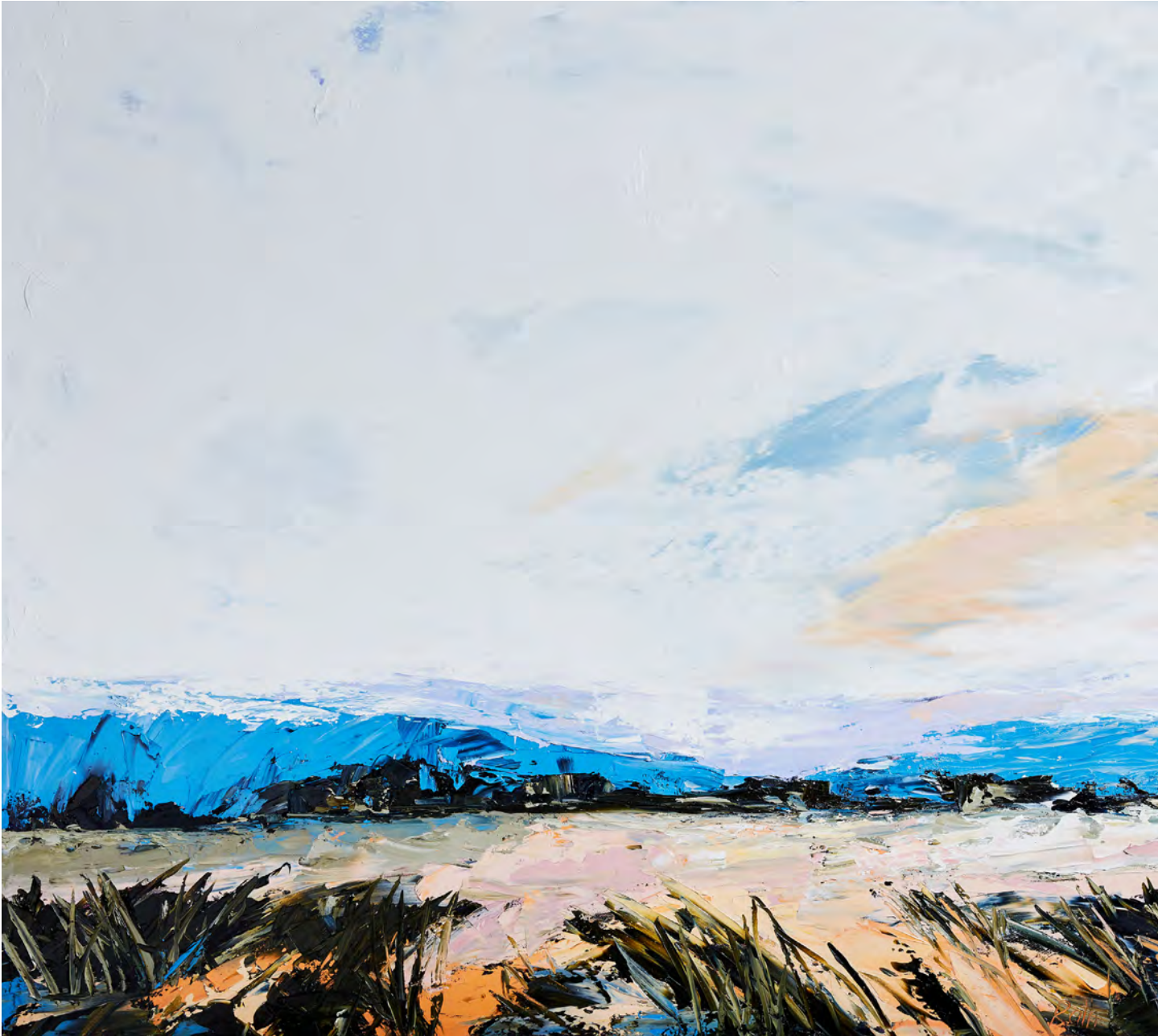
A Wide Expanse of Roving Plain, Hunter Valley 2021, oil on canvas, 120 x 150cm