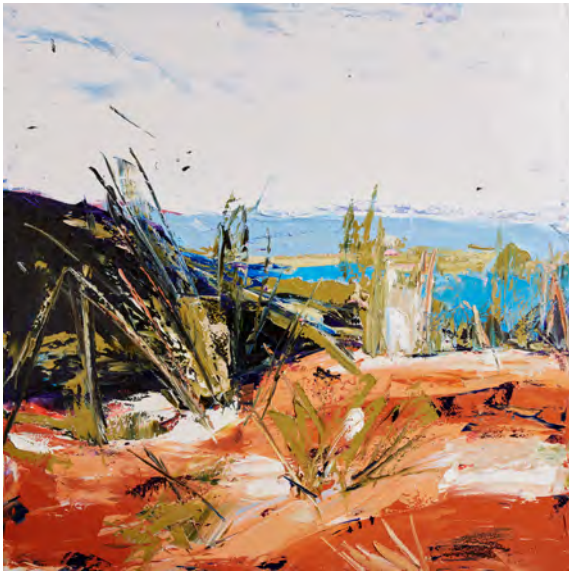
A Land So Strong