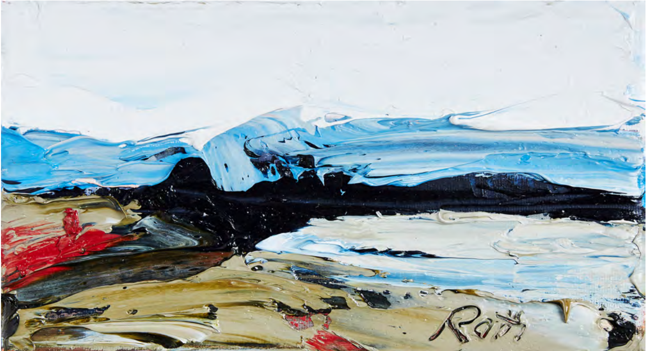
Hunter Valley Plain i 2021, oil on wood, 13 x 23cm