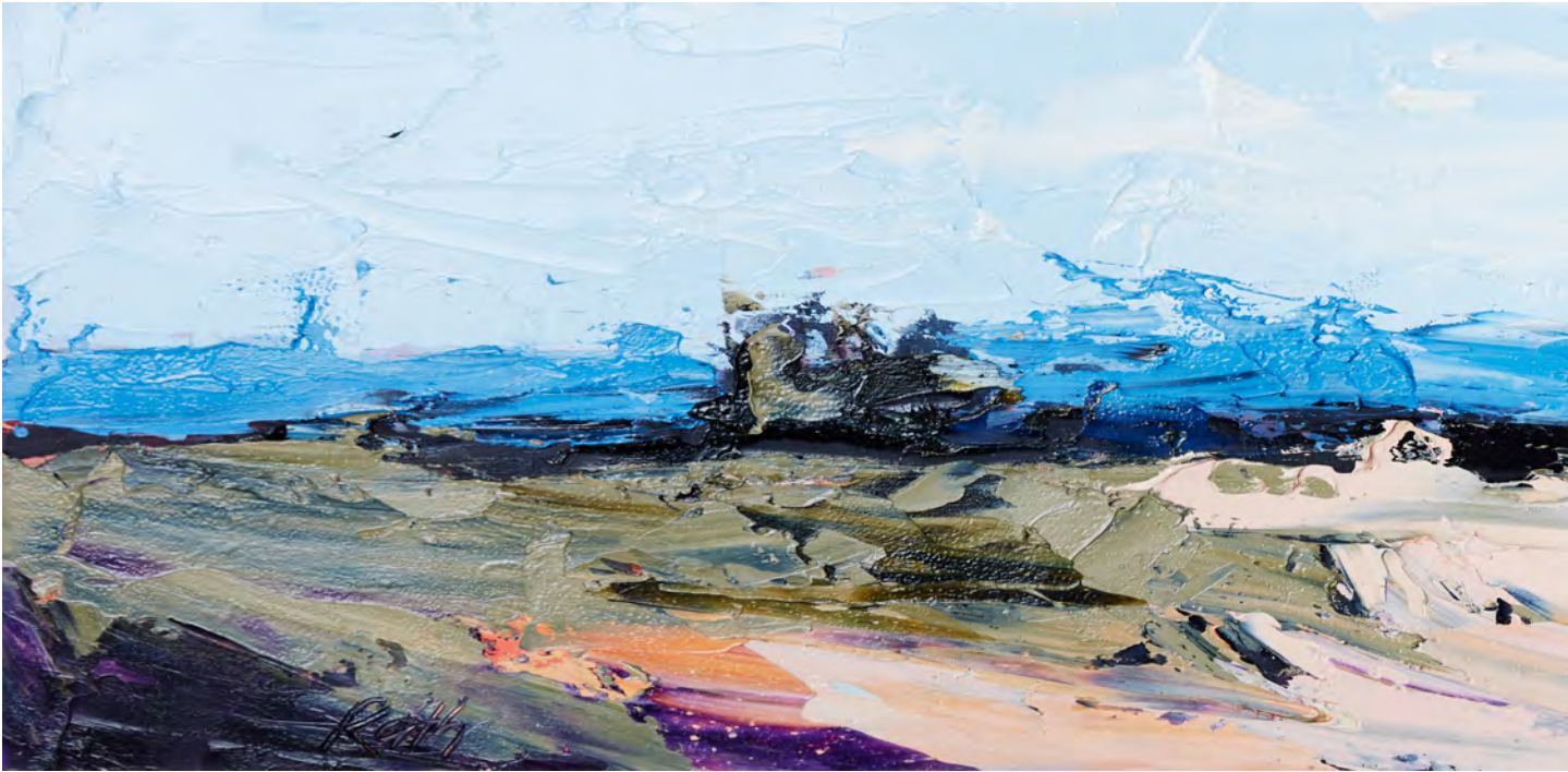
View Towards the Barringtons 2021, oil on wood, 30 x 120cm