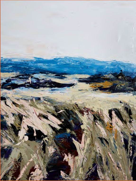
Native Grasses Tall as Grain, Bowed, Waved and Rip 2021, oil on canvas, 120 x 90cm