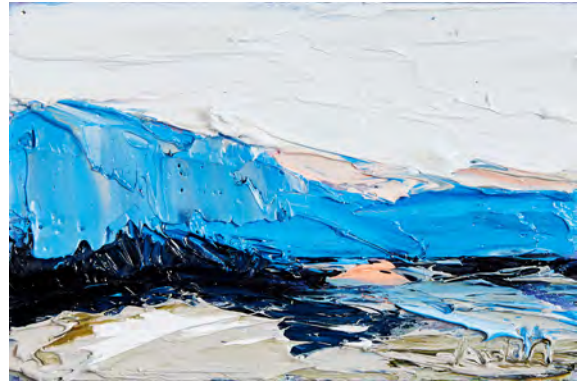
The Broken Back ii 2021, oil on wood, 10 x 15cm