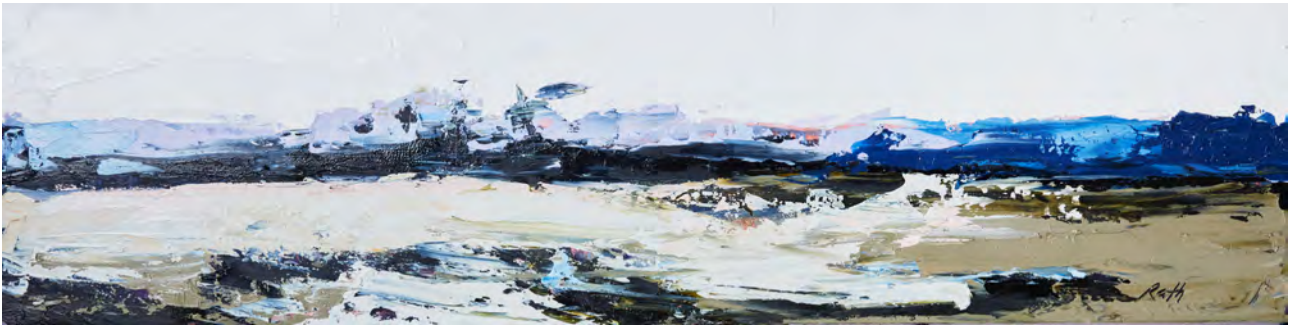
Autumn Sky, Pokolbin 2021, oil on wood, 30 x 120cm