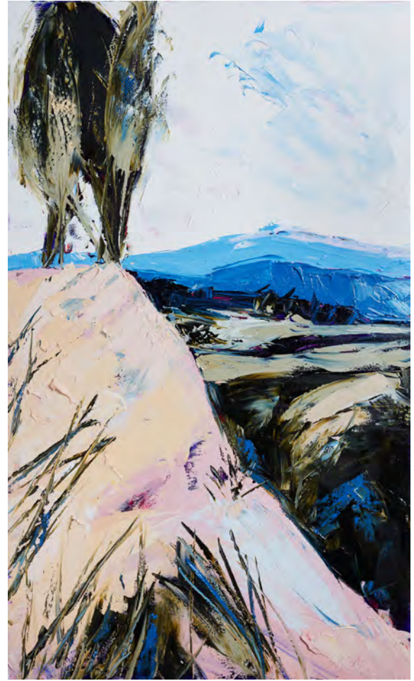
Rocky Heights and Walls of Stone ii 2021, oil on canvas, 153 x 90cm