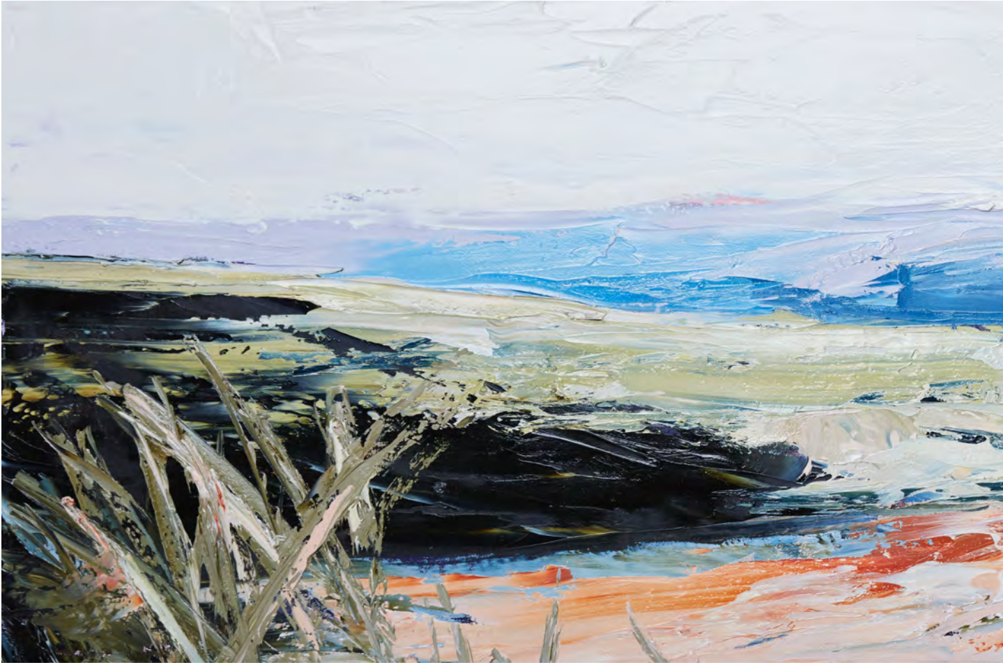
View from Yellow Billy, Broken Back Range 2021, oil on canvas, 50 x 152cm