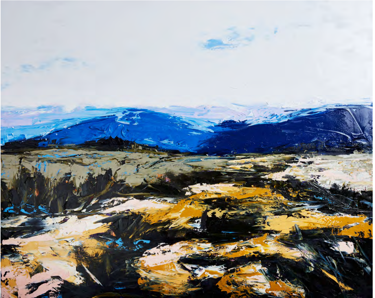
In Tones the Bushman Only Know 2021, oil on canvas, 120 x 150cm