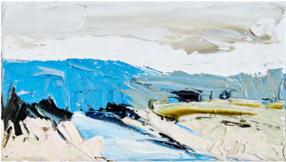
Hunter Valley Plain iii 2021, oil on wood, 13 x 23cm